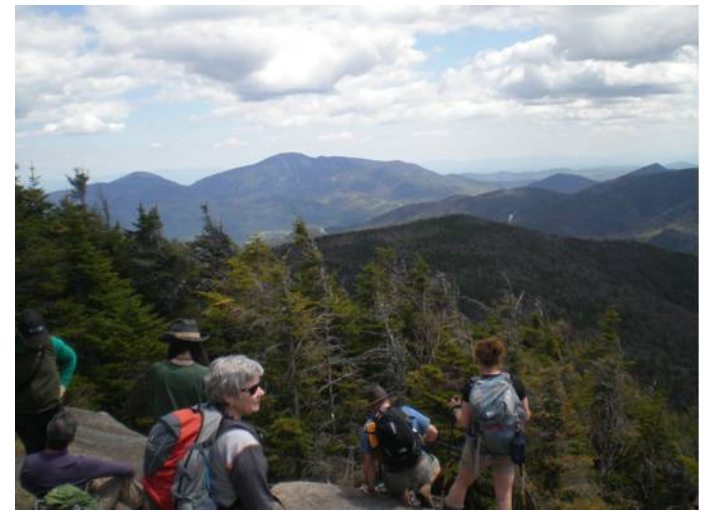
The view from Big Slide