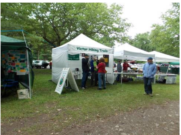
VHT tent at ADK EXPO in Mendon Ponds Park.