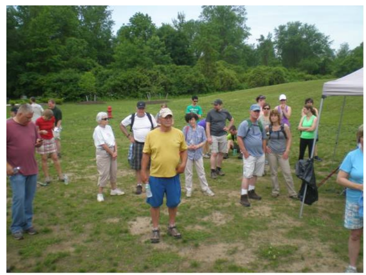
Just a few of the National Trails Day hikers at Victor Municipal Park on June 1, 2013.