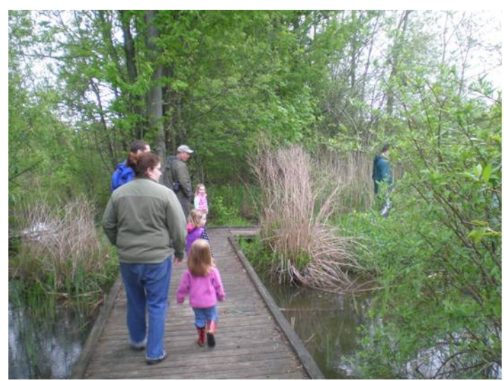
The hike at White Brook Nature Trail was enjoyed by all ages.